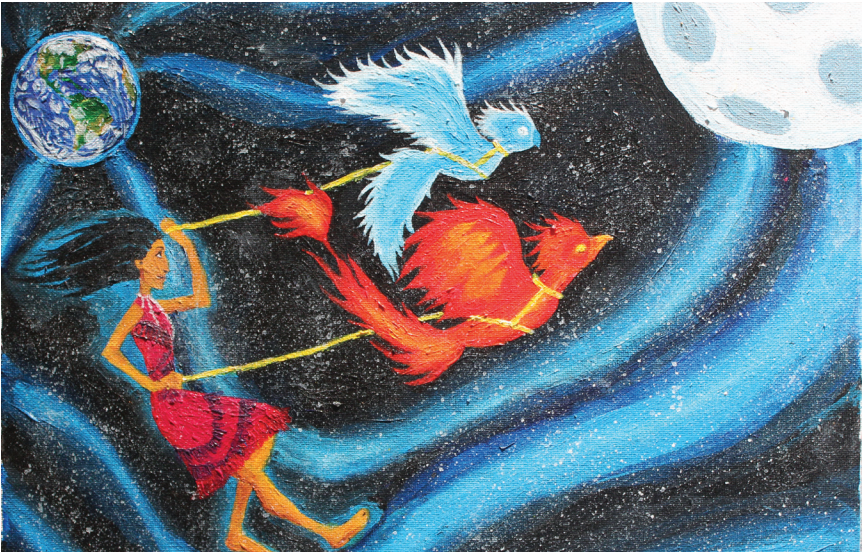
Journey to the Moon