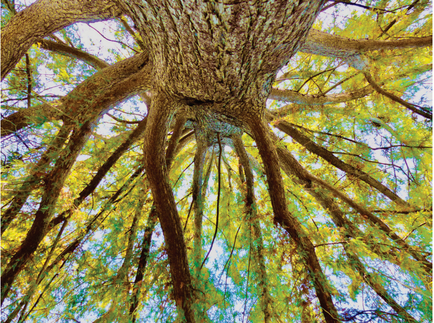
Tree of life