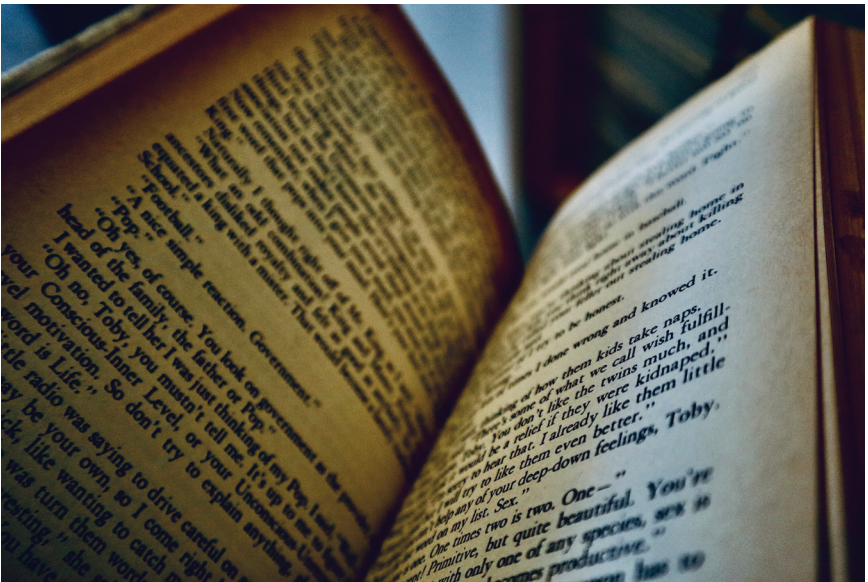
A Good Book