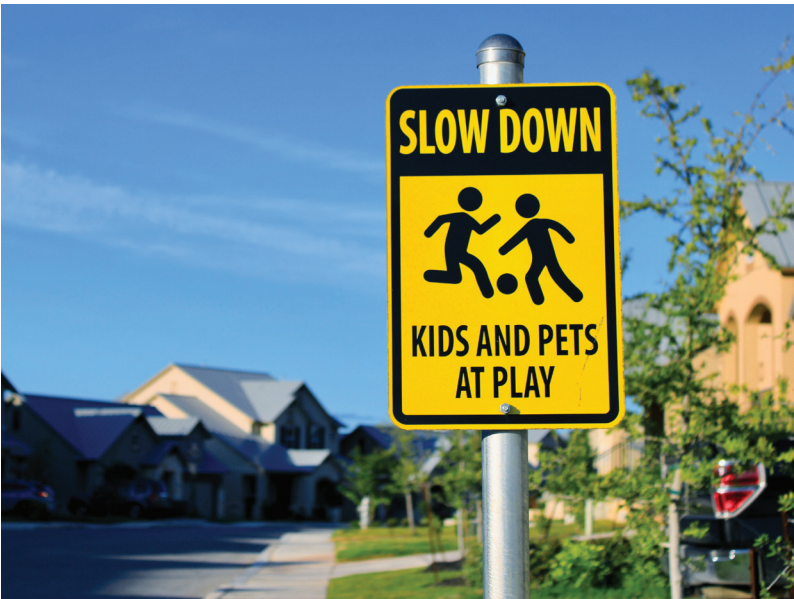
Kids at Play